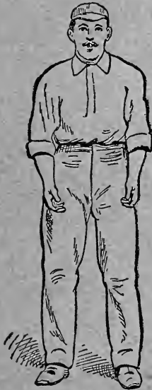
THE BAD SHORT-SLIP.

ball or one to the off is on its way—and that with some bowlers means every ball—short-slip has not only to have his hands out, but his knees well bent, after the fashion of a wicket-keeper. If he does this every time, it means that he is a keener cricketer than many who might be named. One alleviation may be allowed. If the ball goes at or